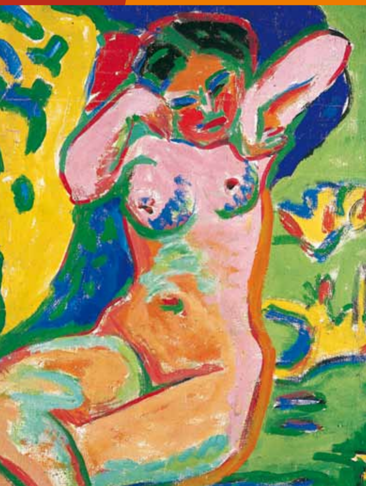
Ernst Ludwig Kirchner, Nude Girl in a Blooming Field, 1909 (detail)