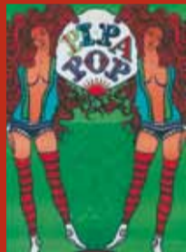
L.-G. Buchheim, PiPaPop poster, 1968 © Buchheim Museum