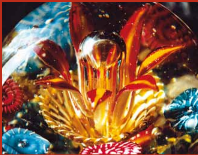
Lothar-Günther Buchheim, Paperweight, 1980s