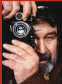
L.-G. Buchheim, Self-portrait, photograph