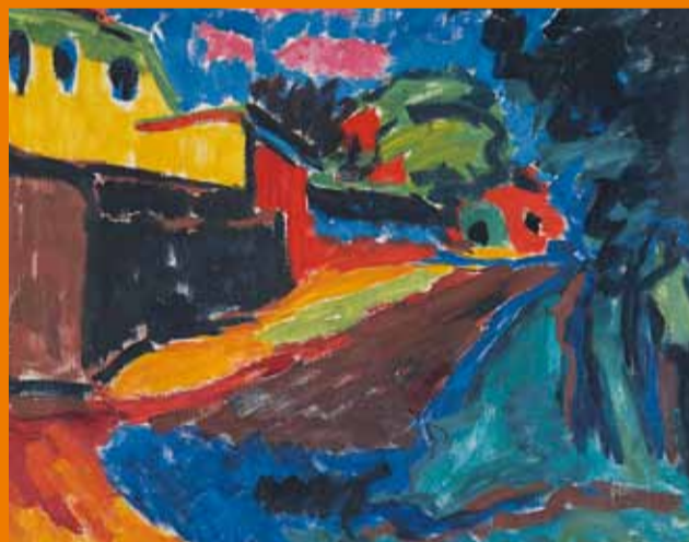
Karl Schmidt-Rottluff, Village Path, 1910 (detail)