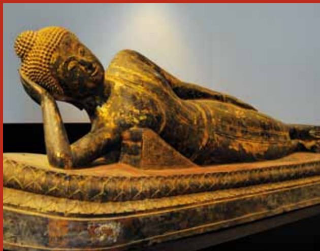
Buddha Mahaparinirvana