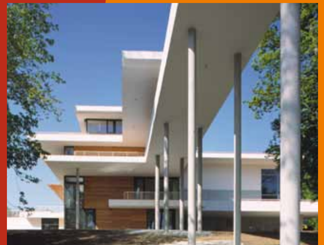
Lakeside view of the Buchheim Museum, photo: © Müller-Naumann

Buchheim Museum, Am Hirschgarten 1, 82347 Bernried am Starnberger See, telephone + 49 81 58 / 99 70 0 Tuesday to Sunday and holidays, November to March 10 am - 5 pm April to October 10 am – 6 pm, closed on Dec. 24 and Dec. 31