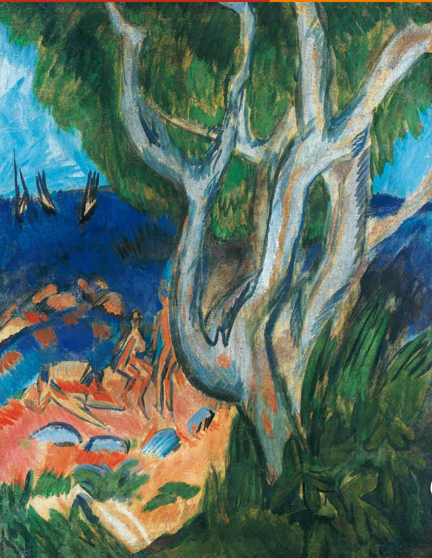
Ernst Ludwig Kirchner, Swimmers on the Shore at Fehmarn, 1913